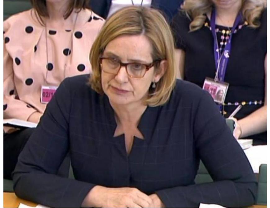
MP Hastings & Rye