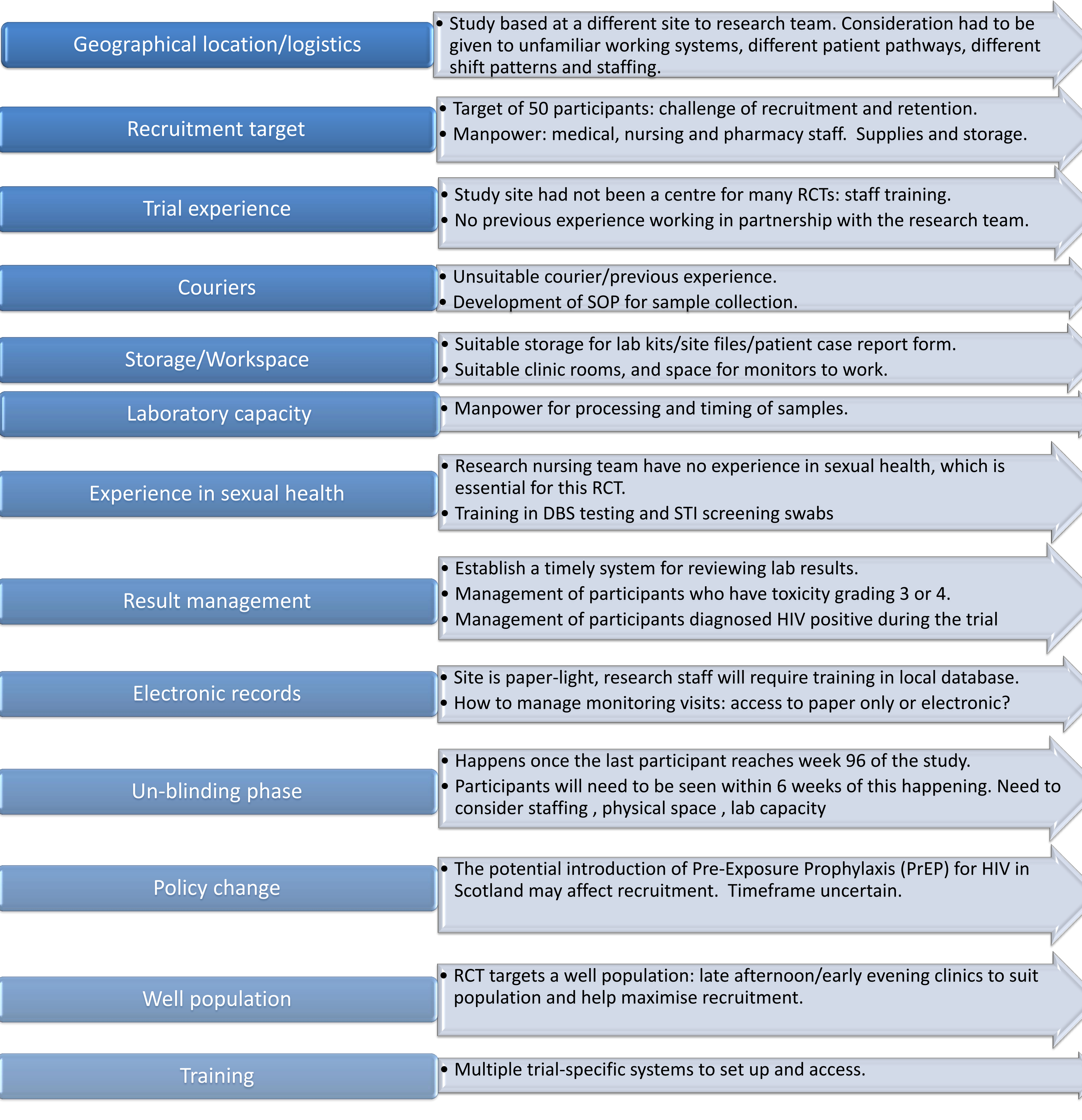
Table 2: Major challenges encountered during set-up